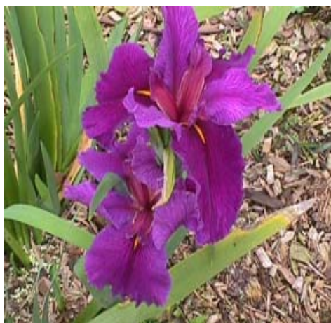
‘Great White Hope’