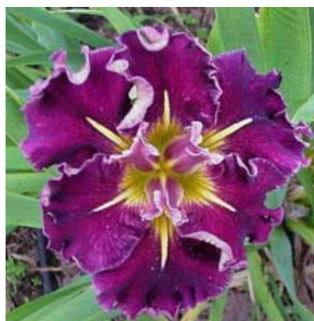
‘Garnet Storm Dancer’