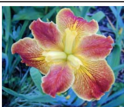
'Cajun Sunrise' voted the most popular Louisiana iris, receiving 38 votes.