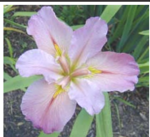
'Felician Hills' was voted one of the most popular Louisiana irises.